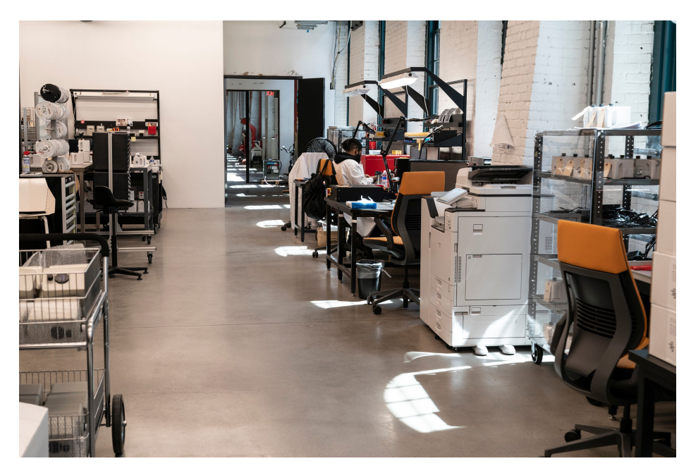
A nanotronics lab in the Brooklyn Navy Yard.