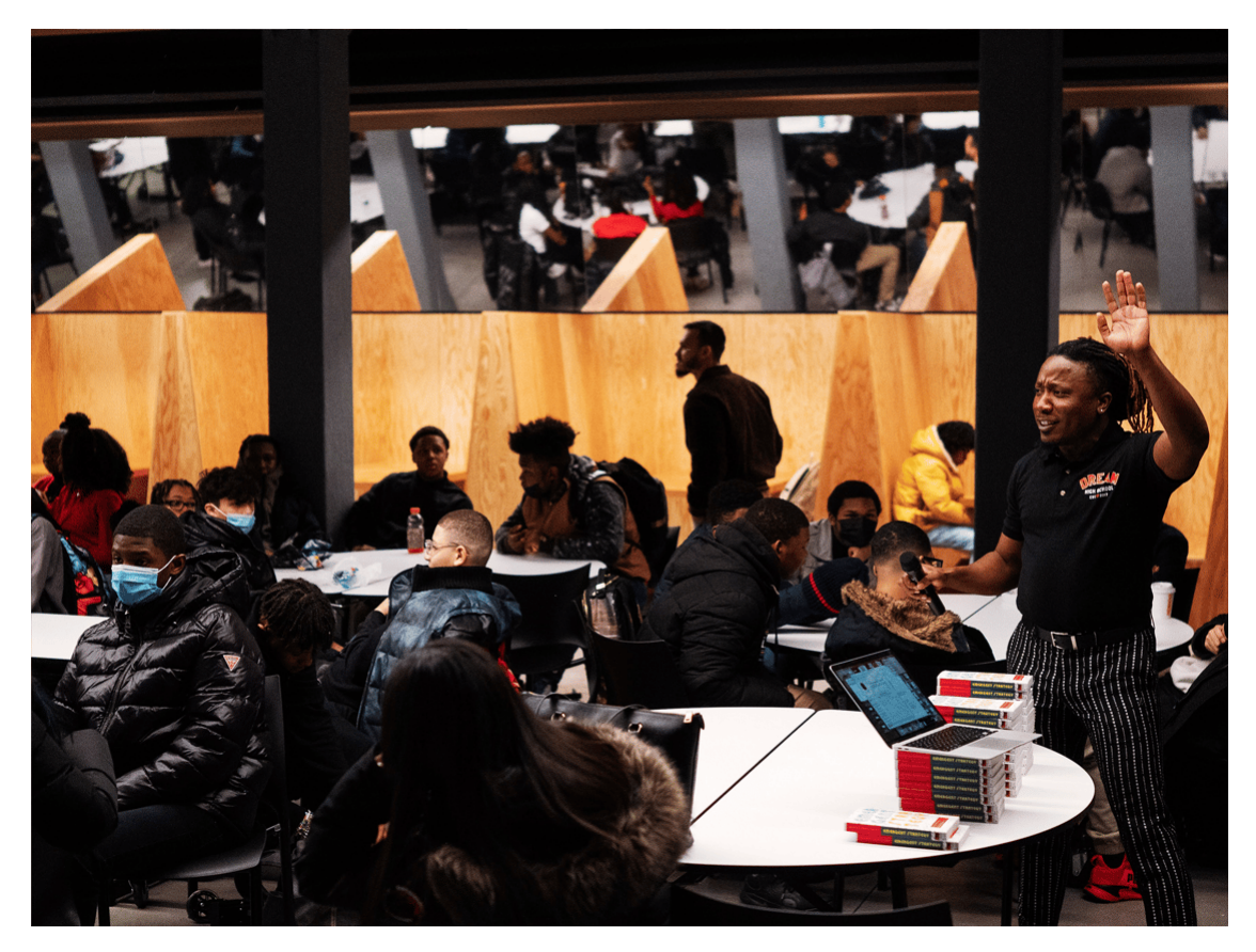
DREAM - Mott Haven Campus: First Day of School

"We like to dream big, and it's hard to imagine dreaming much bigger than DREAM Mott Haven. After all, an investment in a school is an investment in every child who will ever walk through its doors. And when we invest in all our kids as early and deeply as possible —the same way we invest in kids from our most affluent neighborhoods—that's when we make transformative, generational change."