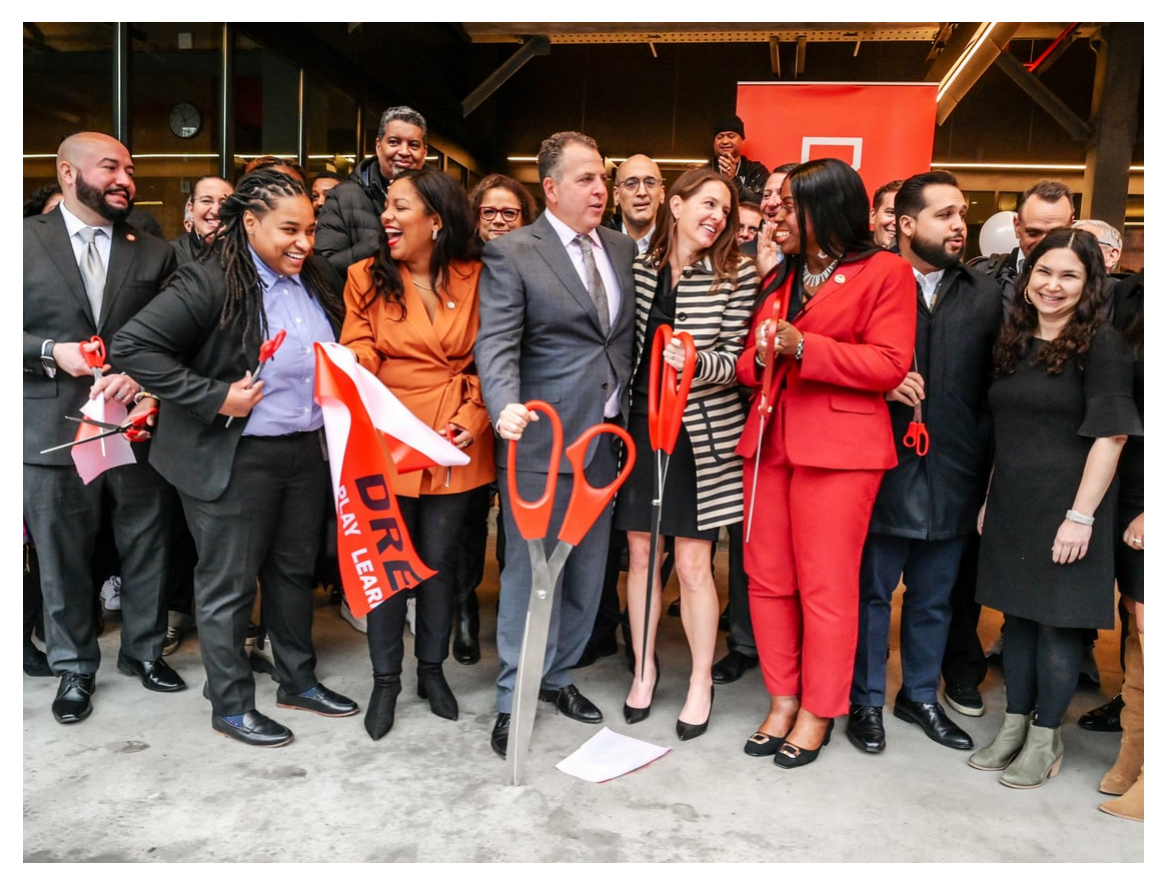
DREAM - Mott Haven Campus: Ribbon Cutting Ceremony

advanced, DBI worked to ensure the execution of each element of the project was to the standards of both client and designer.